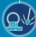
Drain, Sewer and Surface Preparation (DSP)