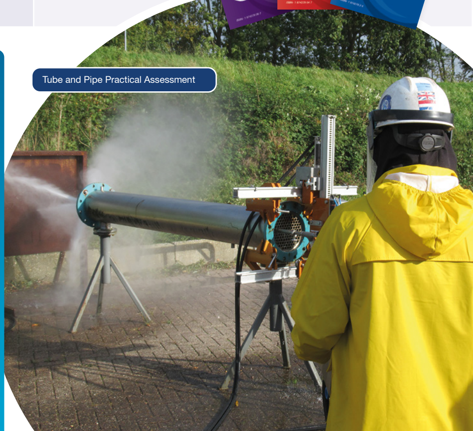
Tube and Pipe Practical Assessment