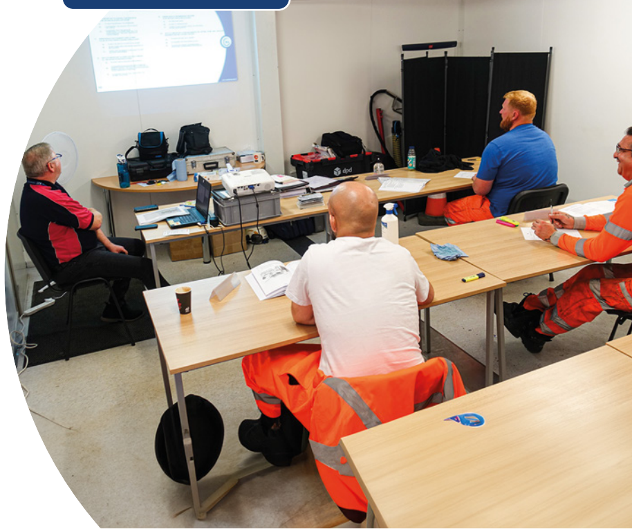
Classroom Theoretical Assessment