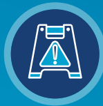
Surface Preparation (SP)