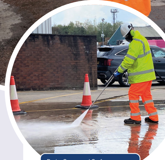
Drain, Sewer and Surface Preparation Practical Assessment