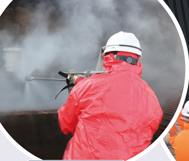
Surface Preparation Practical Assessment