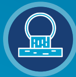
Drain and Sewer (DS)