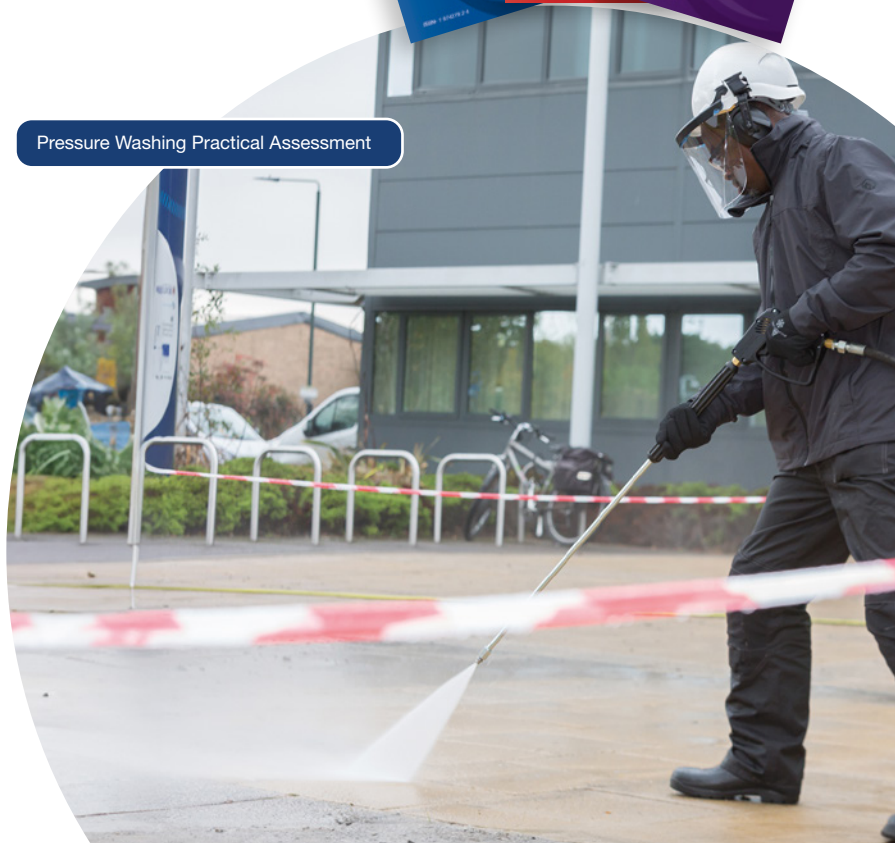
Pressure Washing Practical Assessment